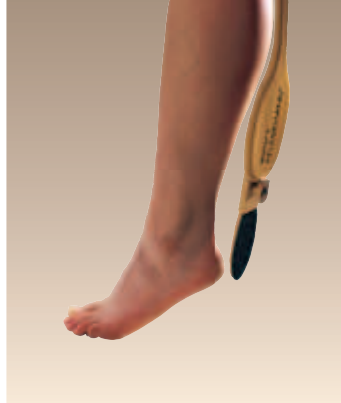
callus file at the universal handle