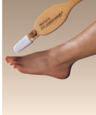
foot / toe cleaner at the universal handle