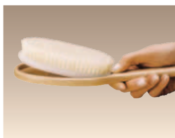
easy changing of the brush